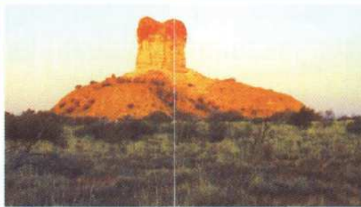
Chambers Pillar